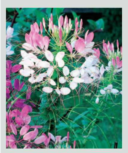
Spider flower is a prolific self-seeder.

For years I never understood why spider flower (Cleome hassleriana), California poppy (Eschscholzia californica), flowering tobacco (Nicotiana spp.), sweet alyssum (Lobularia maritima), and countless classic grown-as-annual self-sowers flourished for