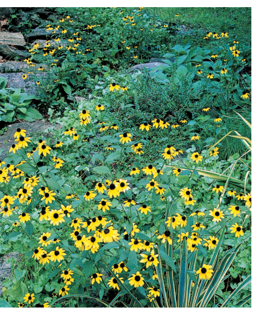
Above: Brown-eyed Susans fill the gaps in the author's garden with splashes of sunny color. Top right: Johnny jump-ups appear among the leaves of 'Sapphire' blue oat grass.

Whether they bloom briefly or look good year-round, easily removed self-sowing plants play many roles in the garden and can be a boon for the busy gardener.