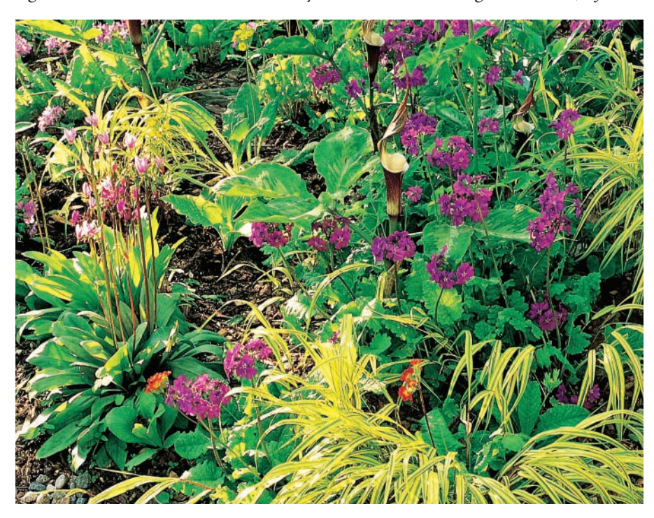
Located away from a natural watercourse, this moist garden in Maine is suitable for cultivating Japanese primroses, which spread happily among other woodland plants.

Other popular plants that are potentially invasive and banned in certain states include water forget-me-nots (Myosotis